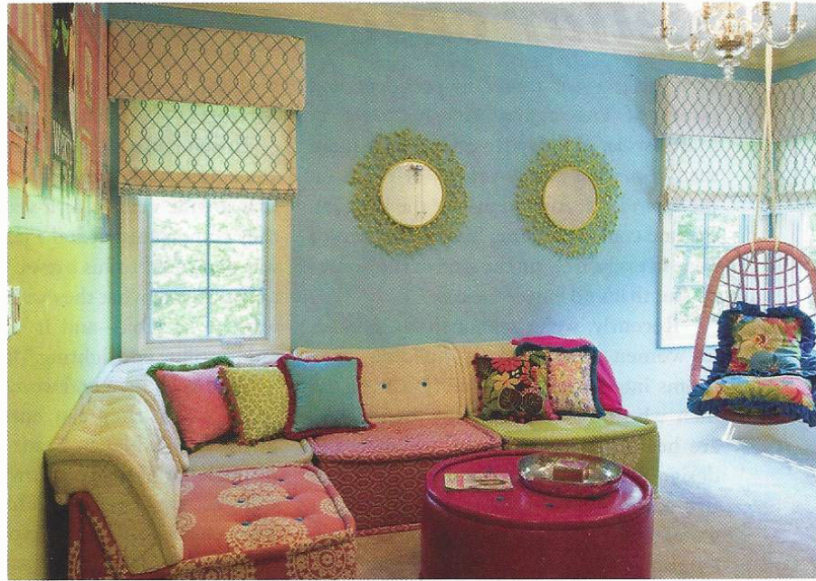
DARK AND HANDSOME: (Clockwise from opposite page) Black makes the living room "pop." Dining room accents display the same sensibility. A tweener bedroom is created to look fantastic, handle abuse and age well. In the kitchen, a wall of glass-fronted built-in cabinetry was transformed from traditional cherrywood to a high-gloss black, with green lacquer inside.